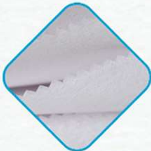
Interlining Fabric Fusing