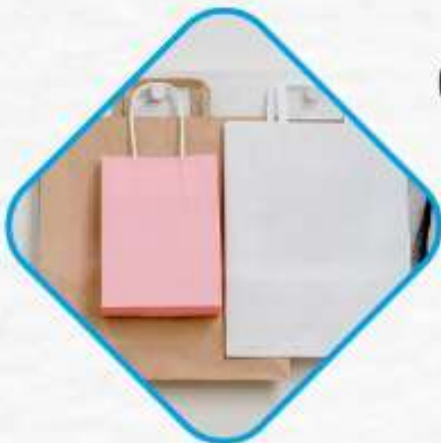
Paper Carry Bag