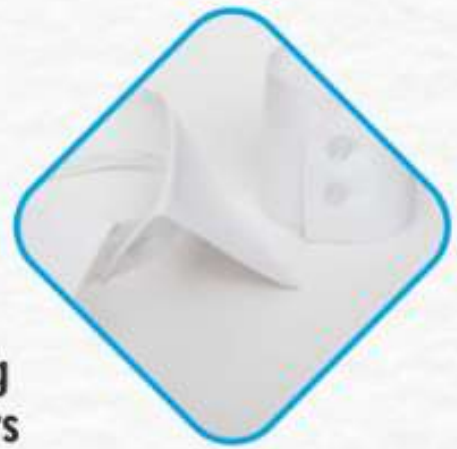
Interlining Cuff Collars