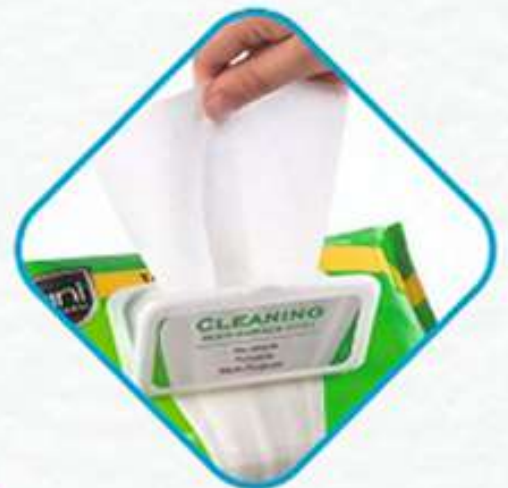
Hygiene Tissue Wipes