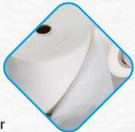
Interlining Fusing Paper